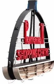
PARRAMALL SHOPPING CENTRE NEON SIGN, 1980-2022

A museum's role in the community is to be a vitalising force.