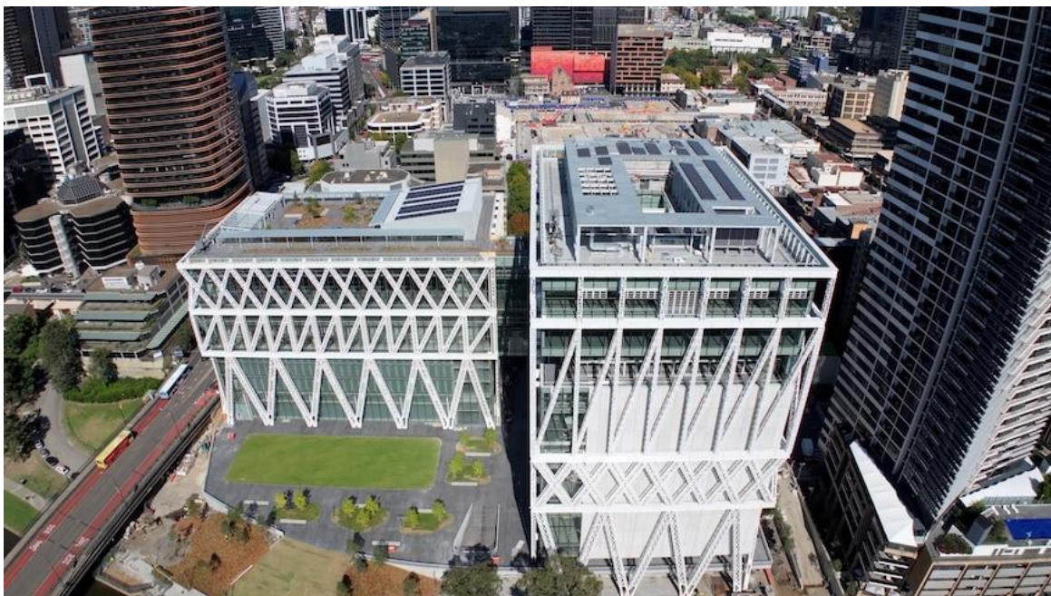
Timelapse of Powerhouse Parramatta construction.

Seven expansive zones are part of the museum, including an 18-metre high space over 2,200 square metres, which will feature Task Eternal, the largest exhibition about space exploration in Australia.