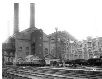
Powerhouse Ultimo Design Competition