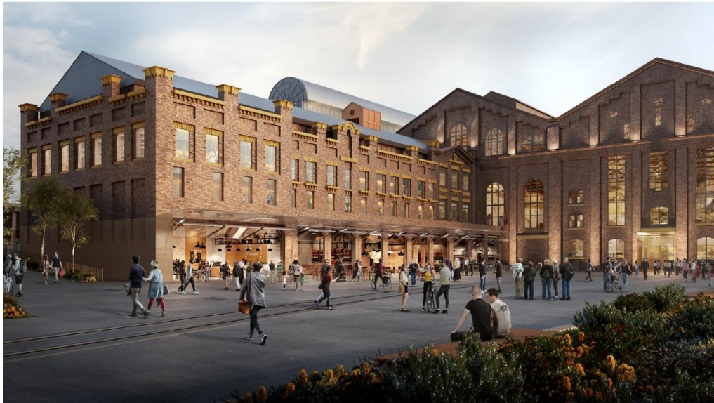
Artist's impression of Powerhouse Ultimo created by Mogamma

A transformative $480–$500 million investment by the NSW Government to reinvigorate one of Australia's most revered and loved museums, Powerhouse Ultimo.